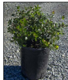
#1 Nursery Container

Maintenance: Water deeply and regularly first 2-3 years; then remove irrigation. Prune to "raise the skirt", prune out lowest branches revealing the distinctive bark. To shape canopy, prune immediately after bloom. Remove deadwood and crossing branches inside the canopy. Hose off foliage weekly. Do not fertilize.